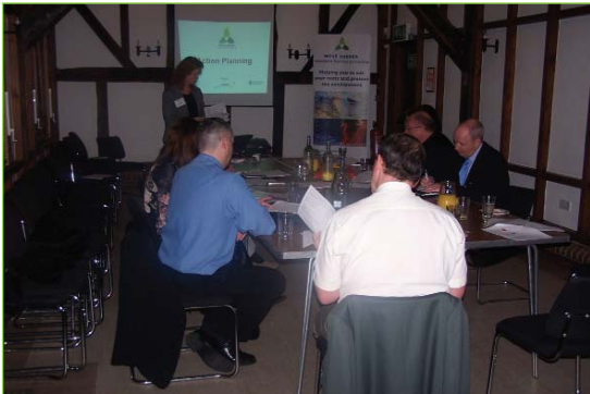
Delegates working hard on their 'Action Plans'

Presentation information from the event can be found at www.egeneration.co.uk/westsussex